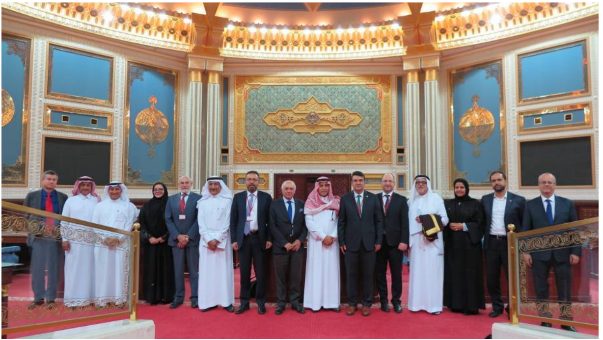
Photo of members of the Friendship Committee in Shura Council with the NATO PA members during their visit.